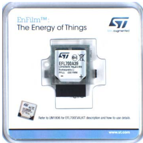
PMB top view