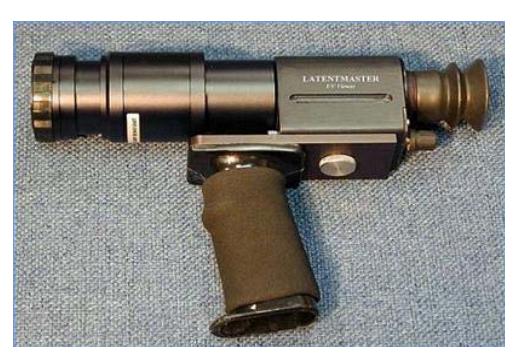
Forensic UV Lamp