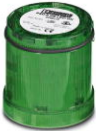
LED permanent light element, 24 V AC/DC, green

Please be informed that the data shown in this PDF Document is generated from our Online Catalog. Please find the complete data in the user's documentation. Our General Terms of Use for Downloads are valid ( http://phoenixcontact.com/download )